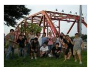
Volunteers at Xiluo bridge