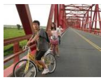
Riding on the Xiluo Bridge