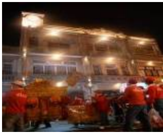
Xiluo Old Street