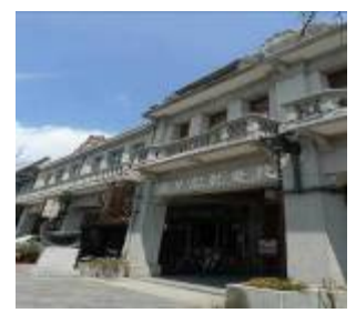
LXiluo Culture Museum